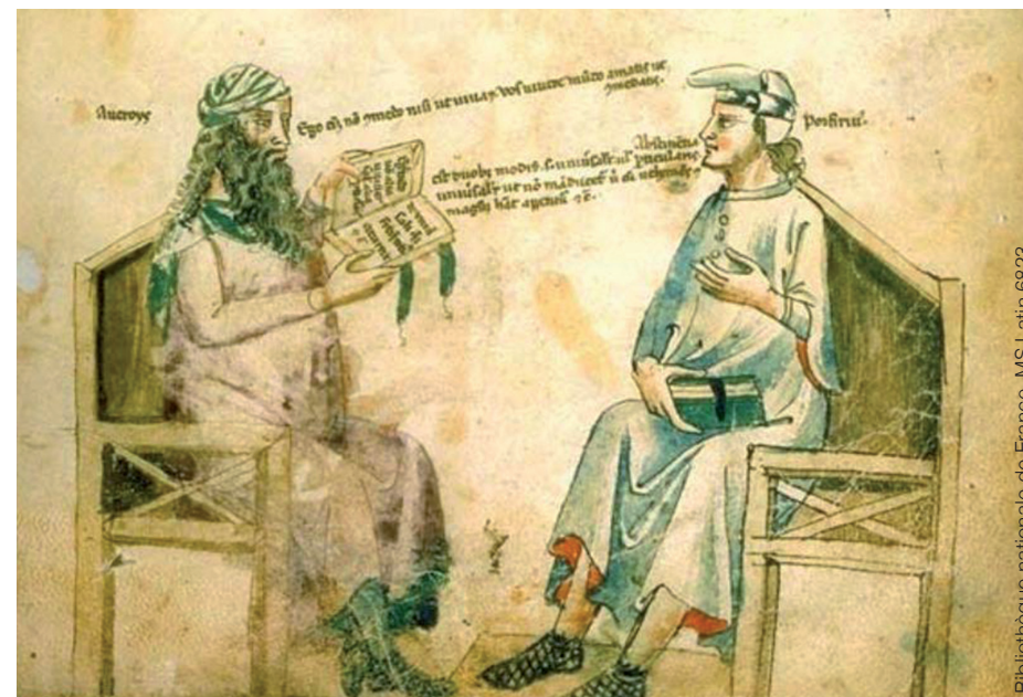
MS Latin 6823

Thursday 20 th / Friday 21 st November 2014